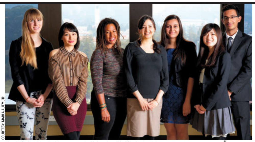
The 1947 Partition Archive team at the University of California, Berkeley.

The archive recently wrapped up a successful funding campaign on Indiegogo, a popular crowdfunding platform to fund additional story scholars in the subcontinent. The UC Berkeley incubator provides them with seating space. Their means of production have also become more sophisticated. Interviews are recorded using DSLR cameras and microphones and are backed up on hard disks.